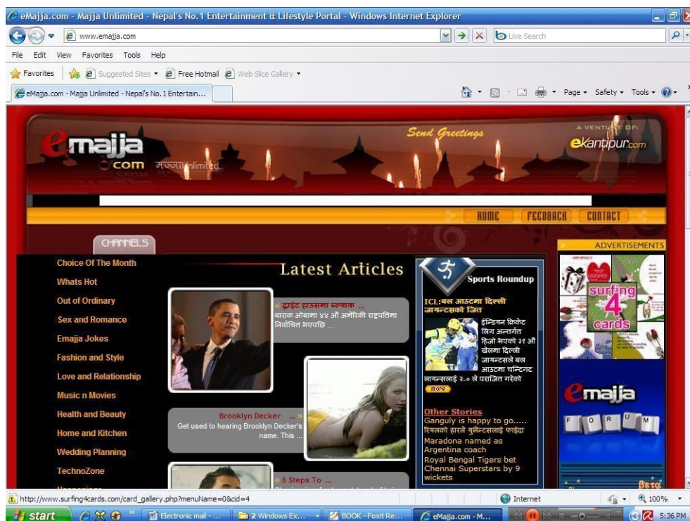
An example of webpage: